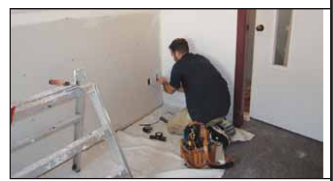
An electrician working on upgrading the electrical