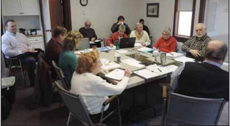
Diocesan Council at work

Minutes from Finance Committee were discussed and approved. Three motions from the Finance Committee were ratified including: approving the $10,000 grant from the Diocese to the Emmaus Community; extending the loan repayment period for Christ Church, Alert Bay from 5 to 6 years at an interest rate of 3%; allowing St. John the Divine, Courtenay to transfer $20,000 from the Trust Account Comox Glebe to pay for capital projects approved by the Asset Manager. Financial statements to the end of January 2016 were received and the second draft of the 2016 budget was presented and approved.