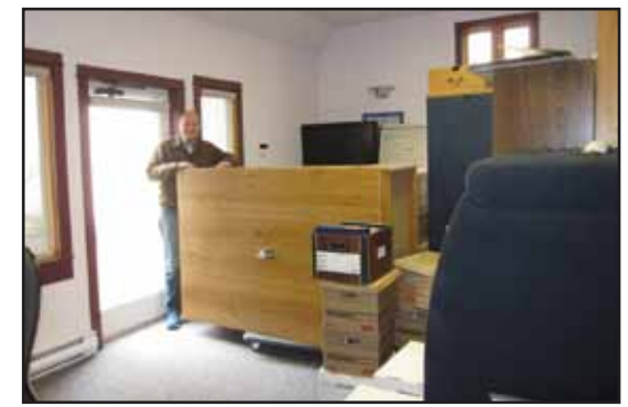
Files and office equipment find storage in the rest of the conference room