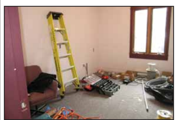
This will be the Executive Officer's new office