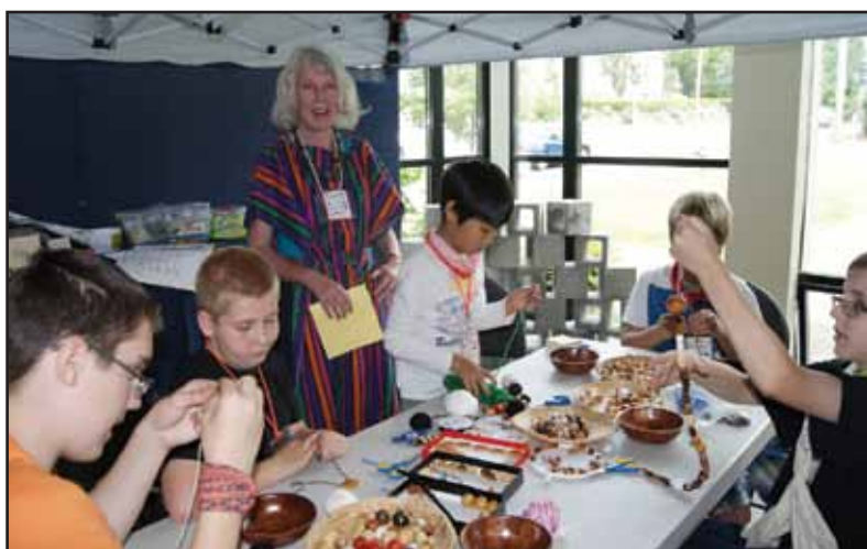
Craft time at last summer's camp

Registration fees are $30 first child / $25 second child / $20 third child. Early Bird Registration Fees until June 3 are $10 less per camper. As part of our June 3 Fantastic Friday, we will have an Early Registration Evening in the hall at St. Luke's from 4:30 - 6:30 pm.