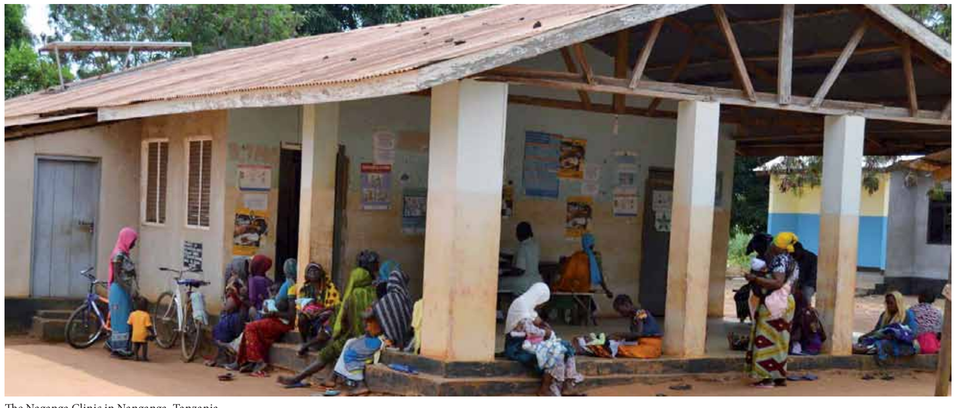
The Naganga Clinic in Nanganga, Tanzania